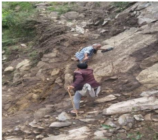
A pedestrian road swept away by torrents