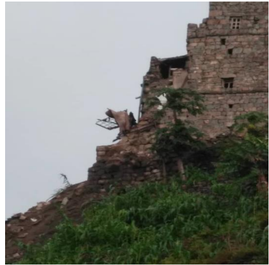
A house collapsed as a result of the rain