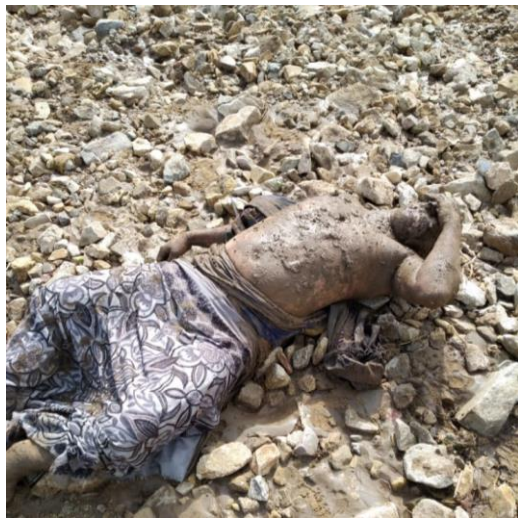
Body of a man swept away by torrents